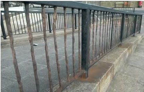
THE CONTRAST ON OPPOSITE SIDES OF THE ROAD

But it's not just for heritage/conservation reasons we are requesting the change to the original colour. The seafront painting team do all the green lamp posts and bollards every couple of years and if we can be included on that team again then we shall no longer be neglected.